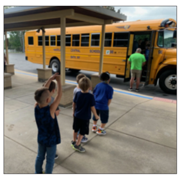
Students participated in bus safety drills taught by Haverling Transportation staff during the first week of school.

Special thanks to members of the Haverling Transportation Department who taught proper bus safety rules to students during the first week of school. Last year, Haverling buses covered 393,855 miles during the school year and we all are doing our part to make sure that everyone arrives at their destination safely.