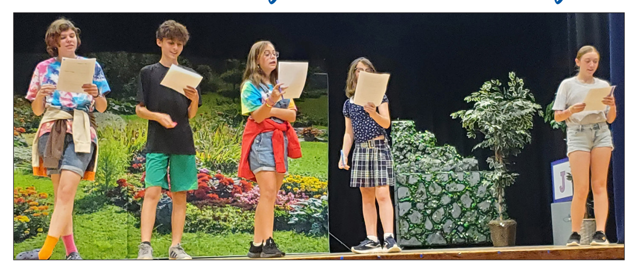
This summer, Dana Lyon Middle School students wanted to come to school! Four week-long Creativity Camps were offered, giving students a unique hands-on learning experience each week.